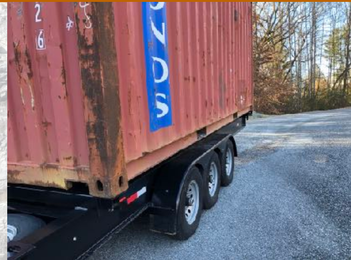
Unique Tri-Axle Design